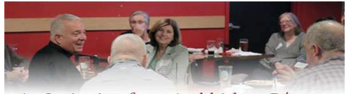
An Invitation from Archbishop Pérez

Visit https://portal.catholicleaders.org/d/xta766 to take the survey or contact the Parish Office for a paper copy.