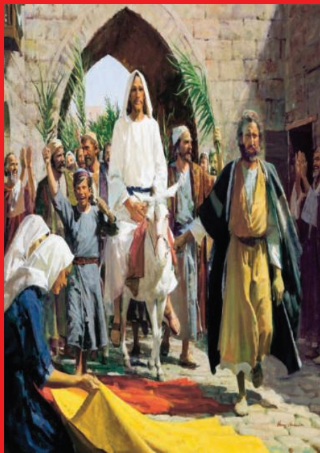
JESUS TRIUMPHAL ENTRY